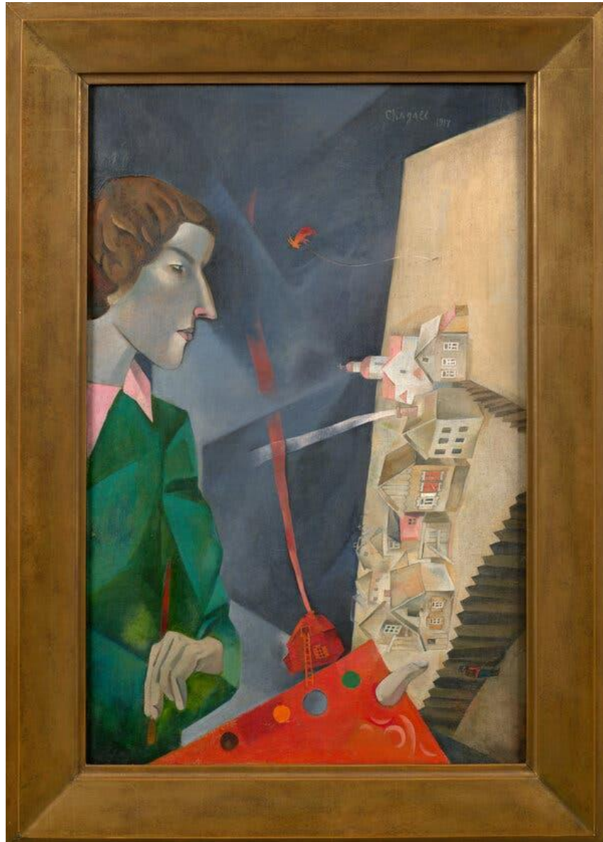
Marc Chagall, "Self-Portrait With Palette" (1917) at David Tunick.