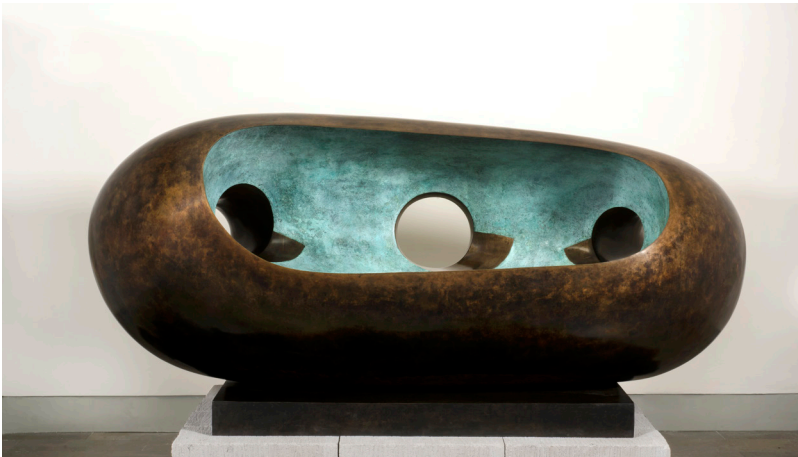
River Form (BH 568), signed and numbered on the base Barbara Hepworth 3/3 , bronze, 89 x 187 x 77 cm

With Formed from Nature: Barbara Hepworth and the accompanying scholarly catalogue, Dickinson continues its tradition of curated stands, with past presentations at Frieze Masters including Expressionism in Europe (2017); Surrealist Revolution (2016); Masters of Cubism (2015); Picasso at the Bateau Lavoir (2014); and Landscape Revisited (2013).