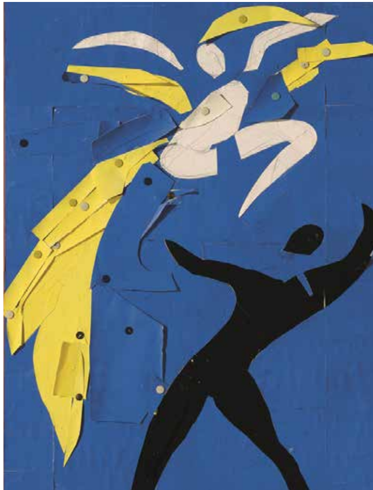
Fig. 4: Two Dancers (Deux Danseurs) , 1937-38, stage curtain design for the ballet Rouge et Noir , gouache on paper, cut and pasted

Matisse created his first paper cut-outs at the end of 1919, when he was commissioned by Sergei Diaghilev to design the decor and costumes for the London production of his ballet Le Chant du Rossignol . Over a decade later, the paper cut-outs became crucially important during the elaboration of the Danse panels for Alfred Barnes in 1932, and then once again when Matisse designed the decor and costumes for the ballet Rouge et Noir in 1937-39 (fig. 4). Matisse then turned to cut-outs during the mid-1930s as part of his preparation for other works, including paintings, prints, and – in the case of the designs for the Chapelle du Rosaire in Vence – even stained glass windows.