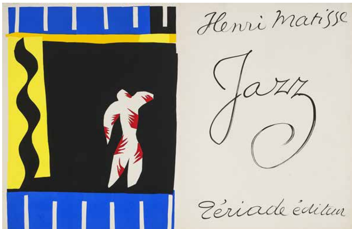
Fig. 8: The Clown , Plate 1 from Jazz , 1947, colour stencil print ( pochoir ) on paper

The present work is a significant iteration of the cut-out mode which Matisse brought to perfection in the 1940s. Striking contrasts of solid colour are combined with the bold arrangement of geometric form. Matisse layers a sheet of luminous yellow paper over the painted blue backing, and his desired composition is achieved by the subtle arrangement and overlapping of small cut-out pieces of black paper onto the yellow background. Square and rectangular blue forms float over the yellow, cut-out image, and the subtle overlapping of these shapes with the black and blue backgrounds at the highest and lowest parts of the work create a dynamic relationship between the layers of the composition (figs. 9-10). 'What the scissors discover', Judi Hauptman has written, 'are the positives and negatives, reversals and inverses, the organic relations between shapes, their generation of one from another' (J. Hauptman, 'Inventing a New Operation', in Henri Matisse: The Cut-Outs , p. 19).