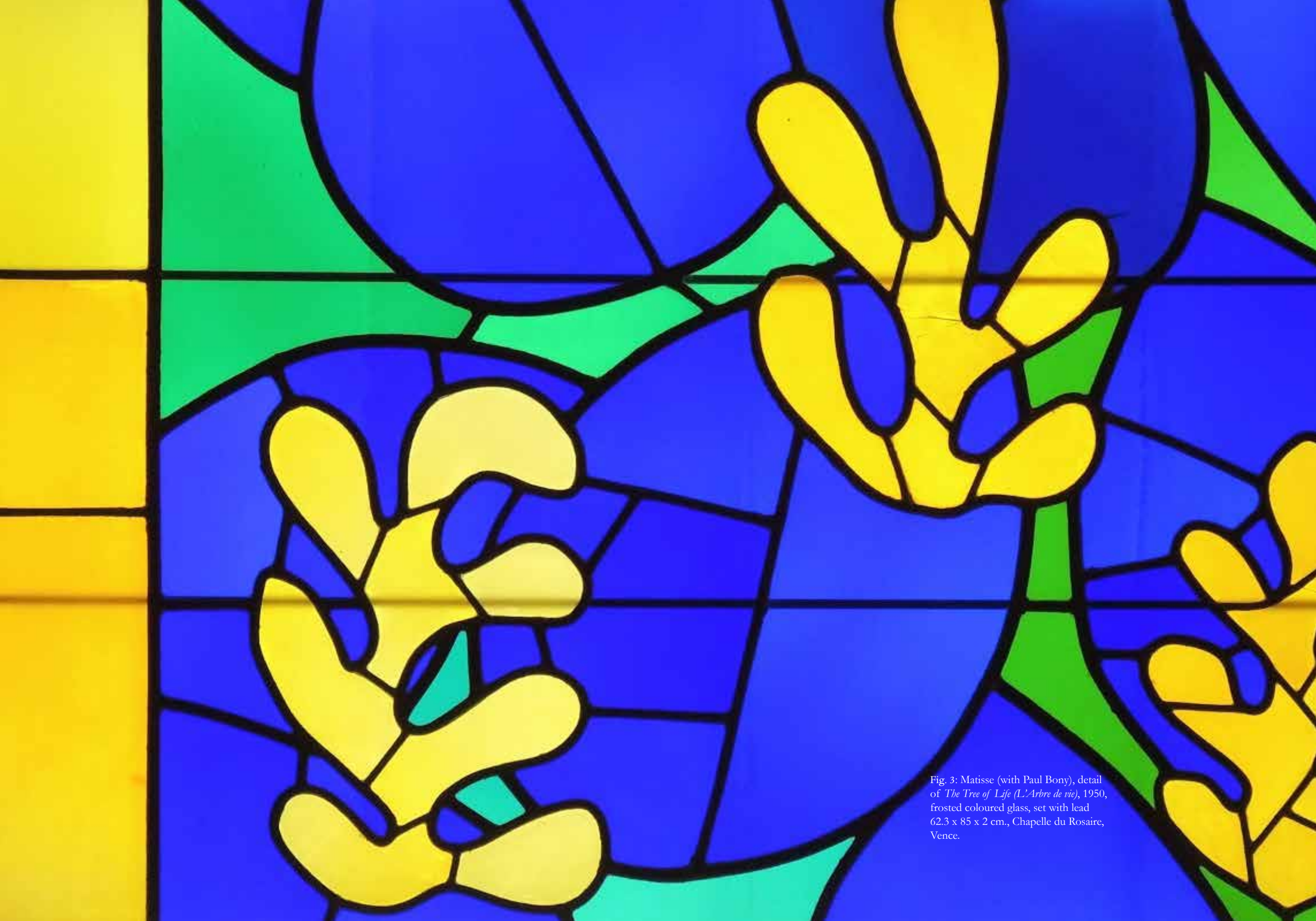
Fig. 3: Matisse (with Paul Bony), detail of The Tree of Life (L'Arbre de vie) , 1950, frosted coloured glass, set with lead 62.3 x 85 x 2 cm., Chapelle du Rosaire, Vence.