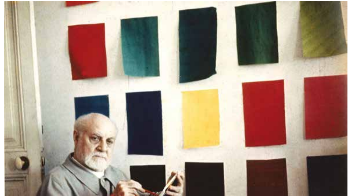
Fig. 6: Matisse in his studio, Hôtel Régina, Nice

Although both Matisse himself and later scholars have cited a desire to unify the disciplines of drawing, painting and sculpture as the reason for Matisse's increasing reliance on cut-outs in the 1940s, this decision also owed something to the artist's failing health. Indeed, during his recuperation from surgery in 1941-42, Matisse further developed and refined his production of paper cut-outs. The cut-outs were created in distinct phases using two core materials: paper and gouache. Studio assistants painted sheets of paper with gouache; Matisse then cut shapes from these painted papers and arranged them into compositions. For smaller compositions the artist worked directly on a board using pins, a method which allowed for quick and easy attachment and alteration as can be seen in the present composition. For larger compositions, Matisse directed his studio assistants to arrange them on the wall of his studio. Subsequently, cut-outs were mounted permanently, either in the studio or in Paris by professional mounters.