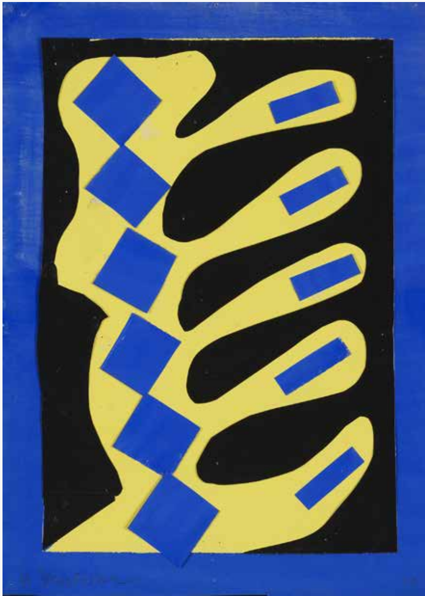
COMPOSITION: YELLOW, BLUE AND BLACK, 1947