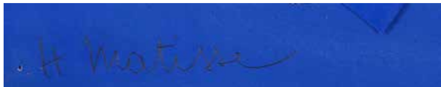
Fig. 15: Composition: Yellow, Blue and Black (detail of signature and pin holes)

Conceived at a time when the cut-out project had reached full maturity, the present work is an important example of the artist's achievement in the medium. With its striking contrasts of colour and bold geometric shape, the work embodies the artist's idea of 'cutting directly into vivid colour'. As Jack Cowart has written, Matisse 'had recognised in his cut-outs a means to something much more comprehensive and fundamental to his aspirations as an artist: a luminous environmental art capable of evoking the calm, untroubled ambiance he had always sought to create. The paper cut-outs were not his ultimate method but a beginning' ( Henri Matisse: Paper Cut-Outs , op. cit., p.33).