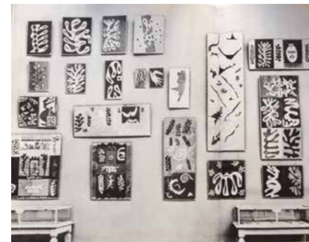
Fig. 2: Henri Matisse, Œuvres Récentes, 1947-48 , Musée National d'Art Moderne, Paris, June – Sept. 1949