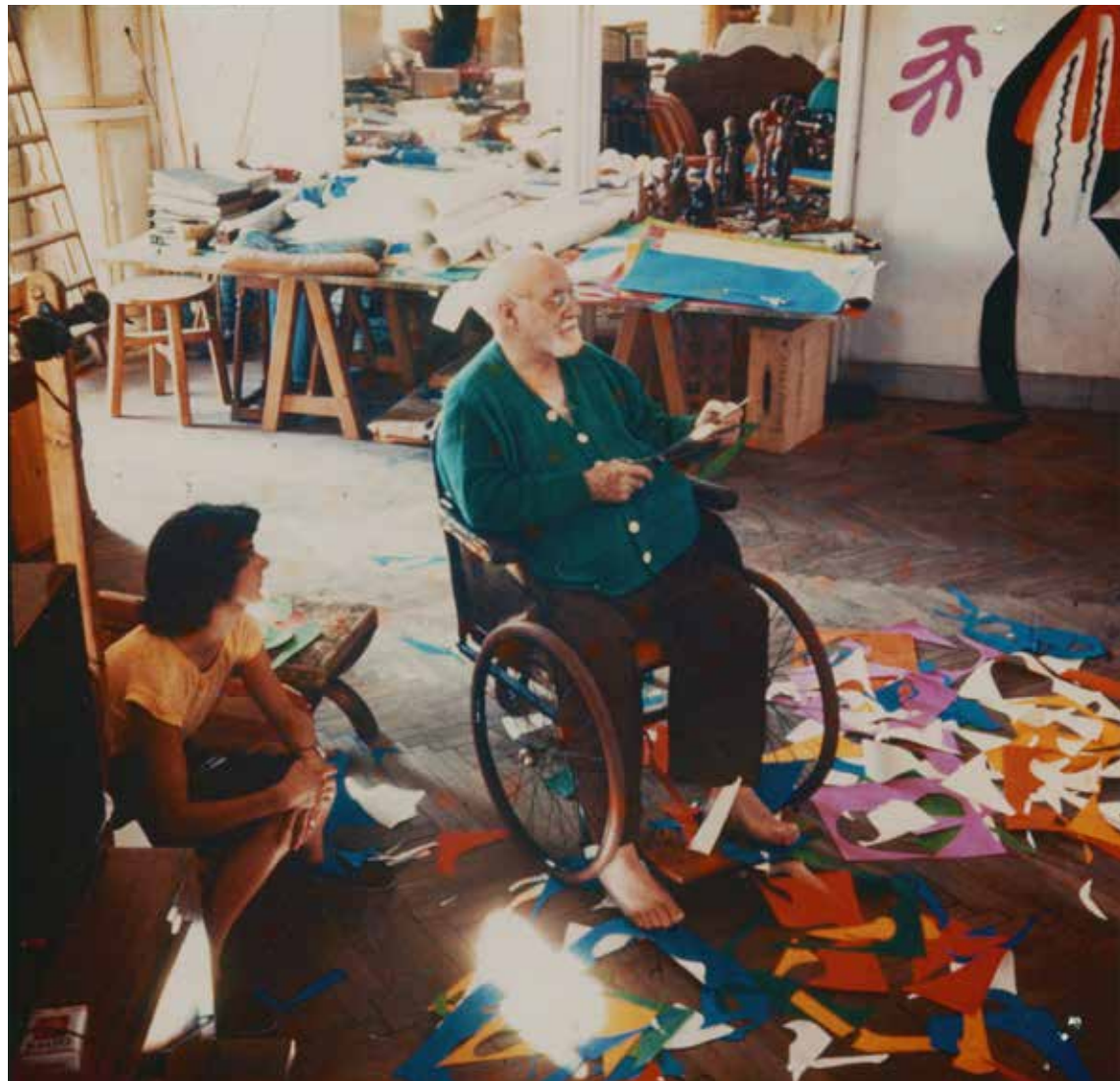
Fig. 1: Matisse at the Hôtel Régina, Nice, 15 April 1950

In April 1947 Matisse returned from a winter in Paris to his Villa le Rêve in Vence. Now 78 years old, Matisse embarked with new vigour on a project that was to be the focus of the last two decades of his life: the cut-outs. As he wrote his to his friend, the poet André Rouveyre, in the following year: 'The walls of my bedroom are covered with cut-outs [...] The result is of more importance than it would seem' (22 nd Feb. 1948). More than a final statement, the cut-outs opened new vistas in Matisse's art, embodying his tireless exploration of colour, line, space and texture. Executed in 1947, Composition, Yellow, Blue and Black was conceived at a defining moment in the cut-out project – an annus mirabilis which saw the publication of Jazz , a printed portfolio of the artist's cut-outs prepared by influential publisher Tériade, and the beginnings of Matisse's final grand project, the Chapelle du Rosaire in Vence (fig. 2).